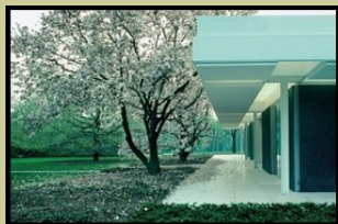
J. Irwin Miller House

Offered by: Sue Thomson Travel Price: $119 per person